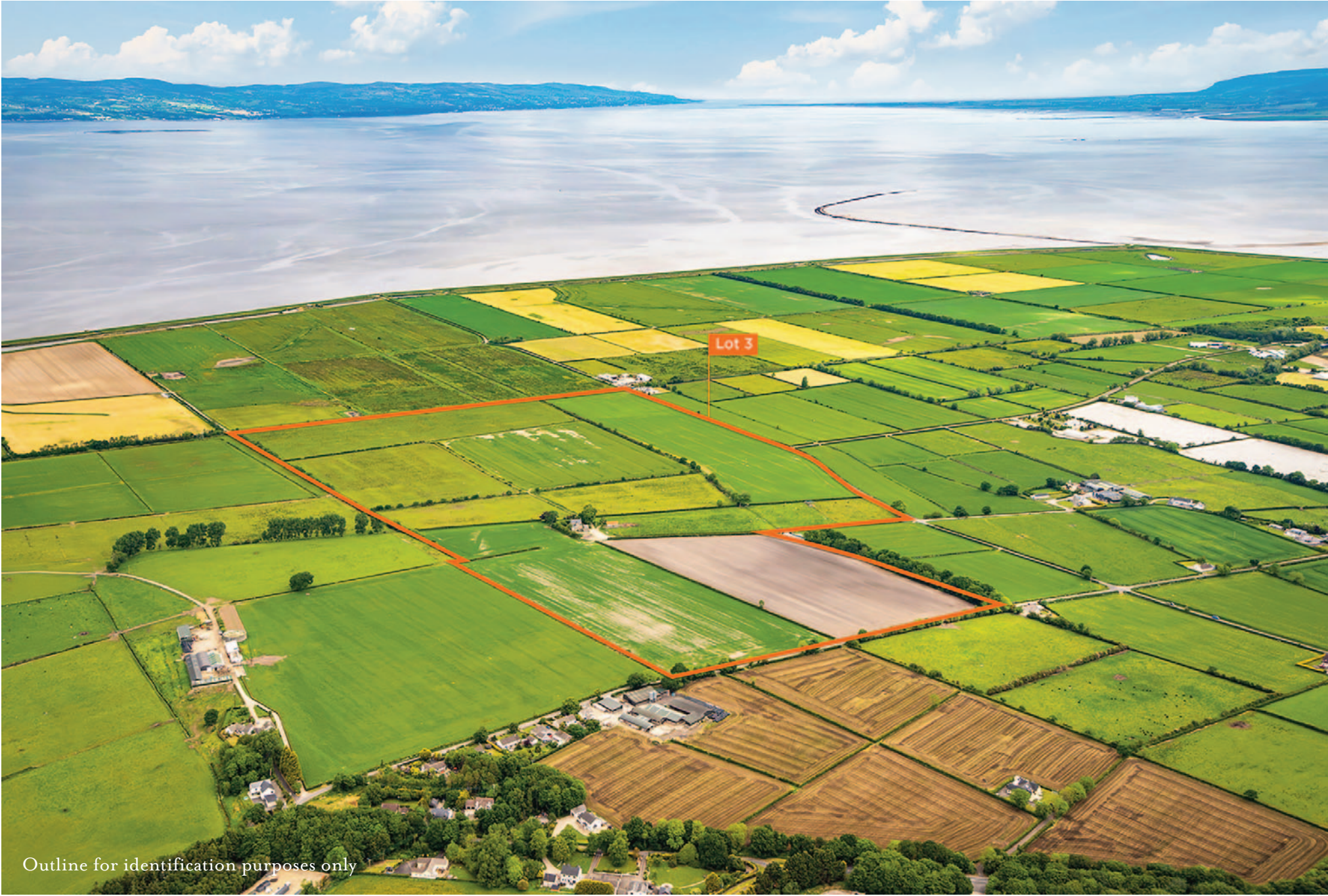
Outline for identification purposes only