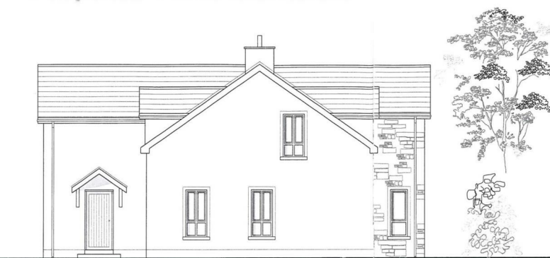
Proposed Left Side Elevation: