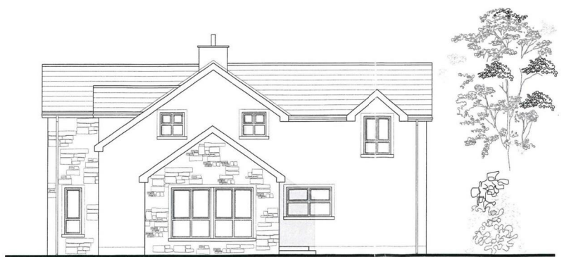
Proposed Right Side Elevation: