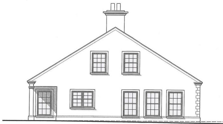
SIDE ELEVATION (SOUTH WEST)