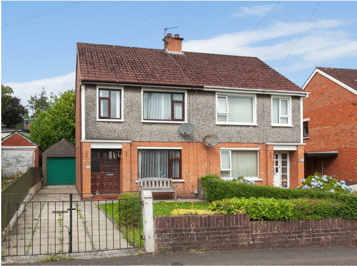
90 Elmfield Road, Newtownabbey, BT36 6DW