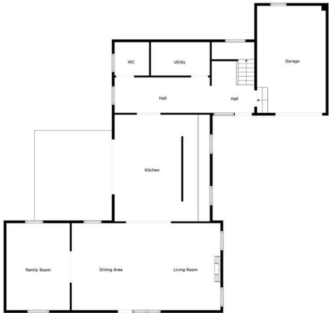
Floorplan Is For Illustrative Purposes Only And Is Not To Scale