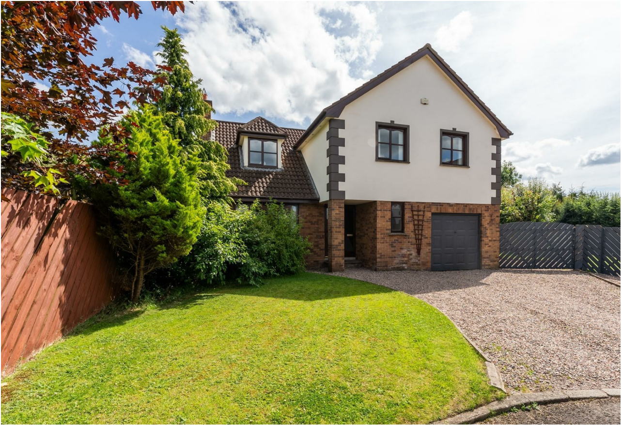
28 Wesleydale, Ballyclare, BT39 9WD