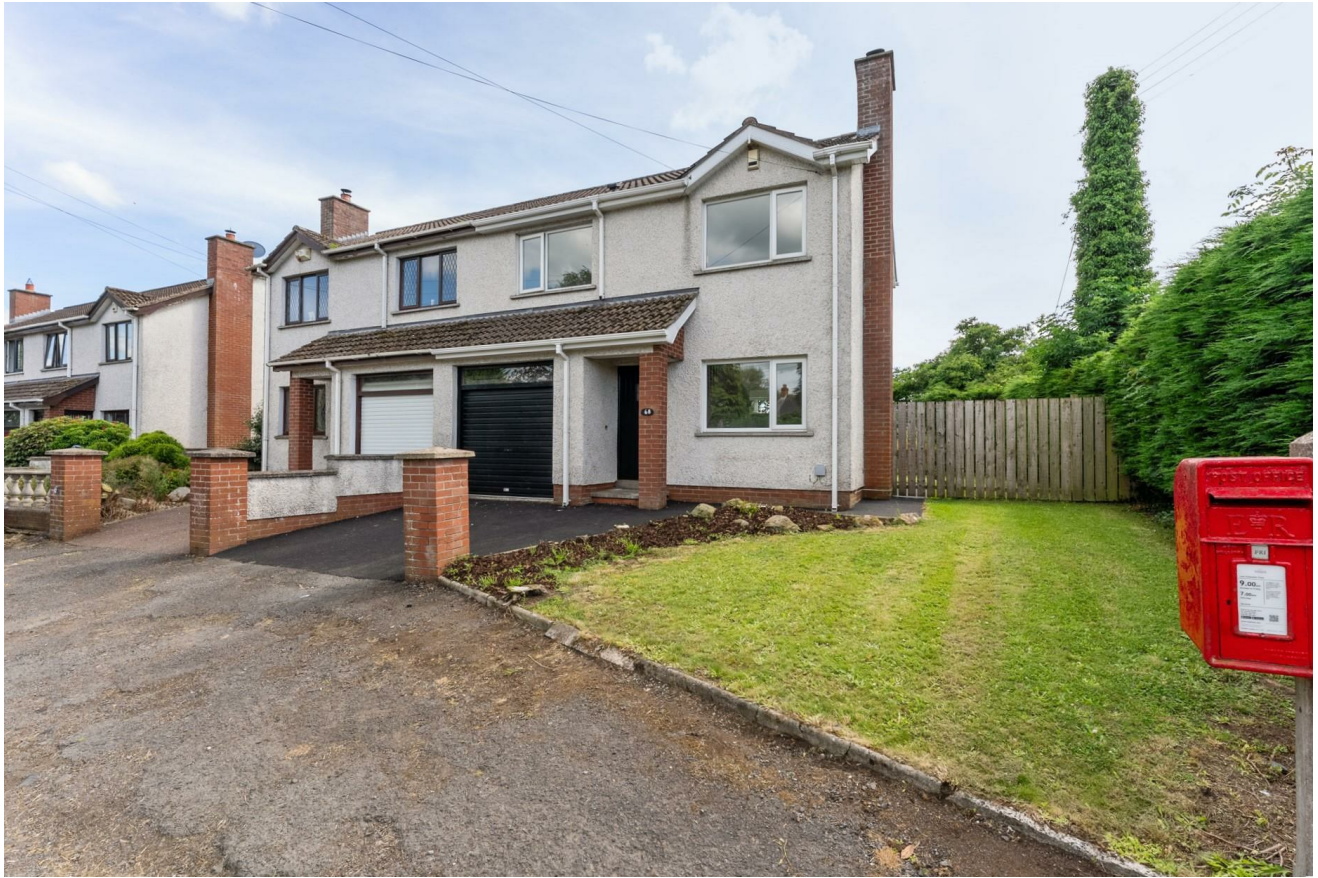
68 Islandreagh Drive, Dunadry, BT41 2HB