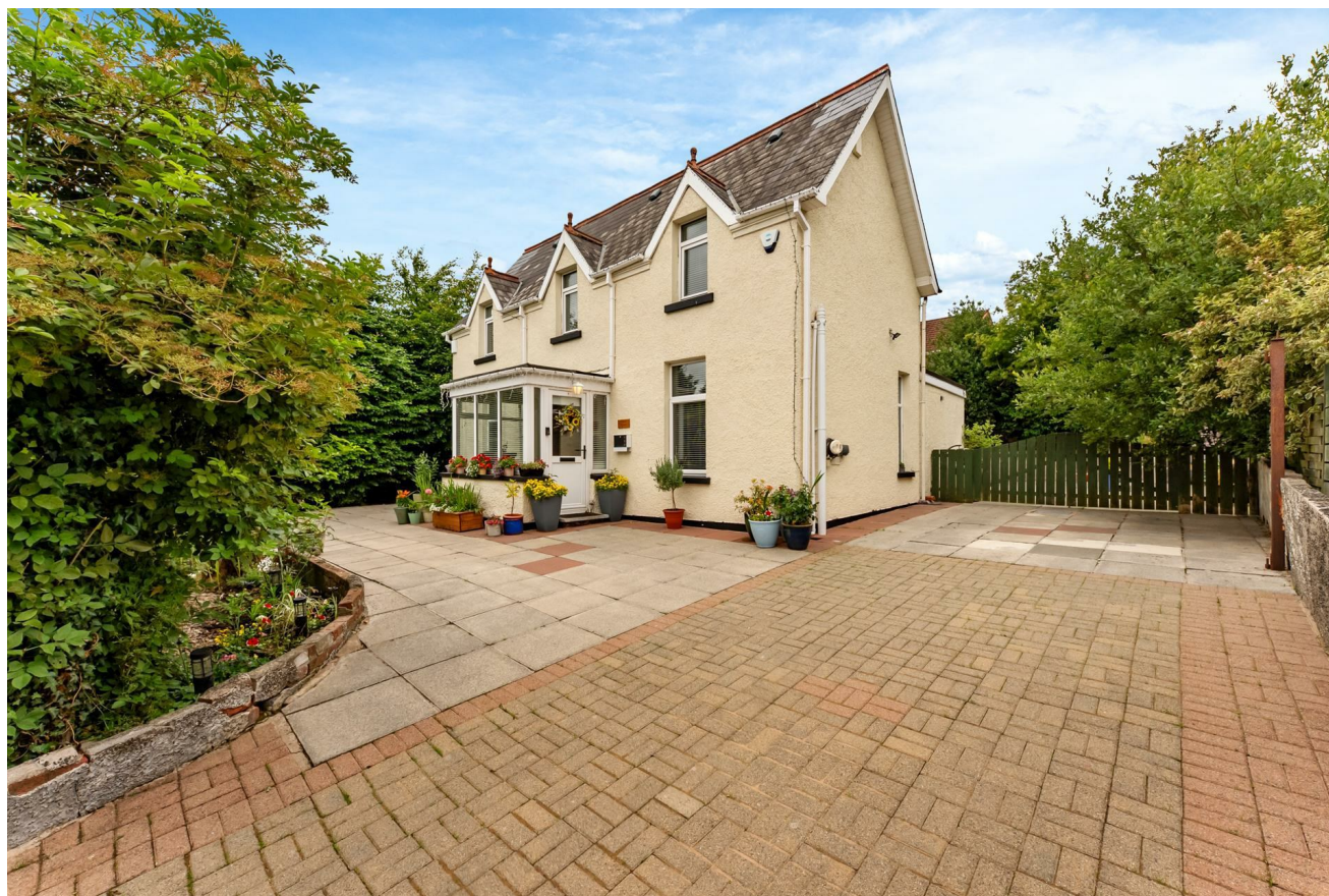
9 Inniscoole Park, Newtownabbey, BT36 6JD