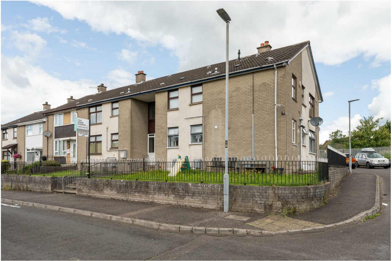
44C Tynan Drive, Newtownabbey, BT37 0HZ