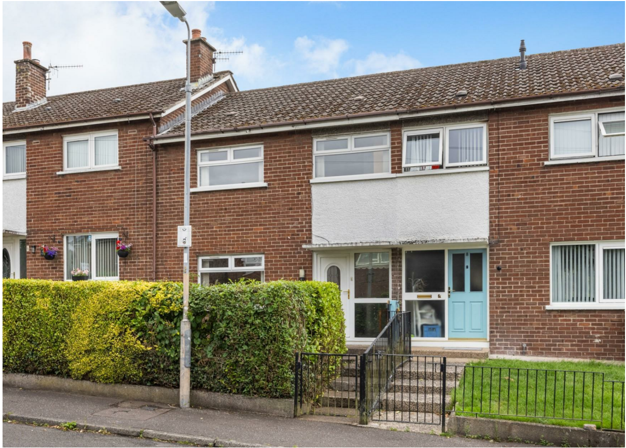
6 Fairyknowe Park, Newtownabbey, BT36 7NZ