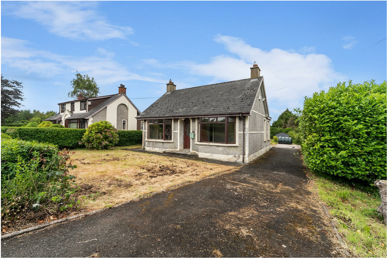
162 Ballyrobert Road, Ballyclare, BT39 9RT