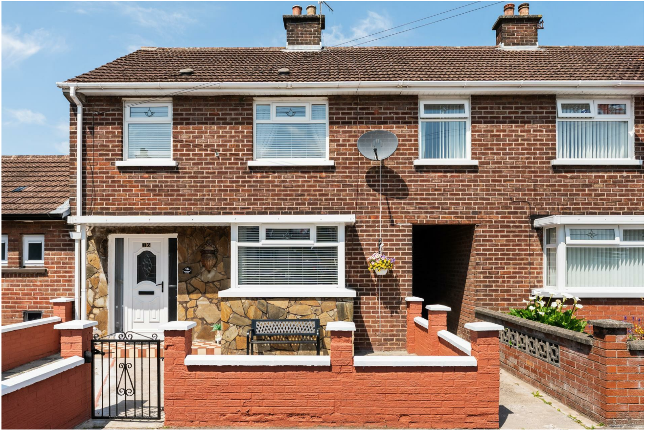
16 Ardfern Close, Newtownabbey, BT37 9AN