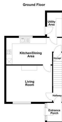
3 Thorndale Close, Antrim