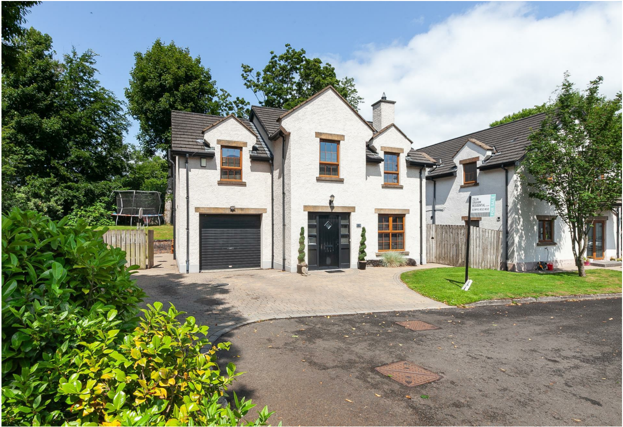
62 Bleach Green, Dunadry, BT41 2GZ