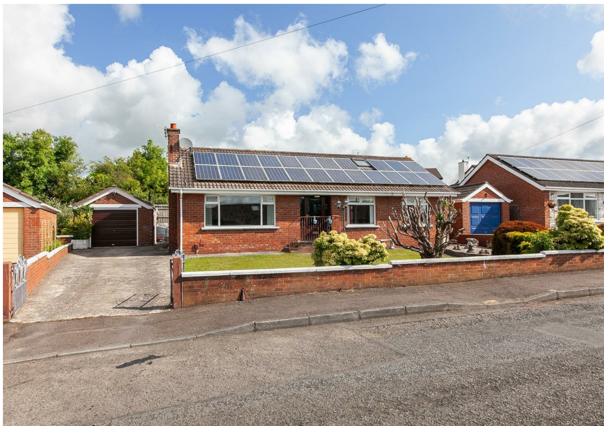
29 Loral Park, Newtownabbey, BT37 0LH