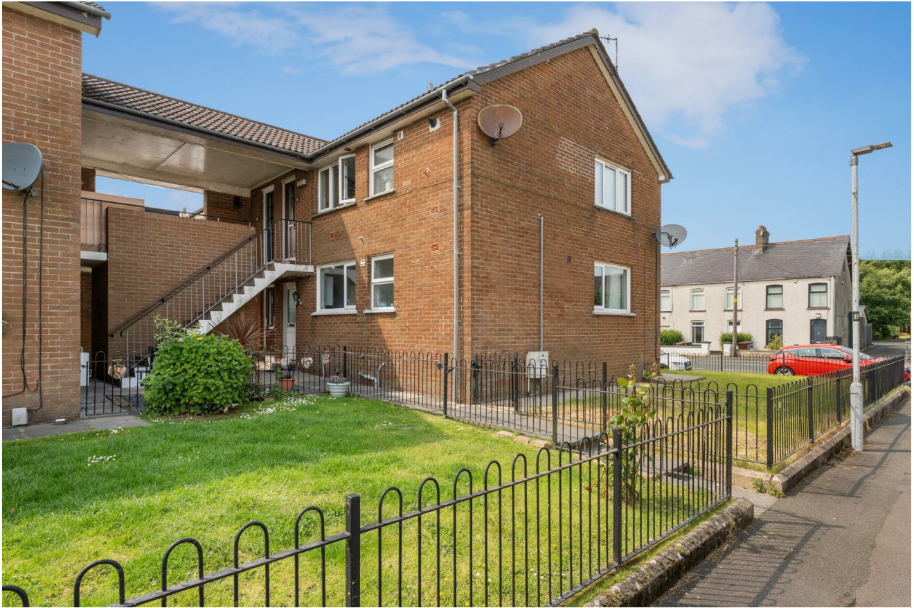
14E Ballyalton Park, Newtownabbey, BT37 0ET