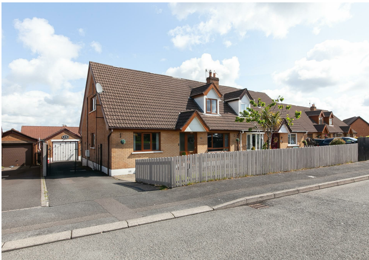
35 Hollybrook Avenue, Newtownabbey, BT36 4ZL