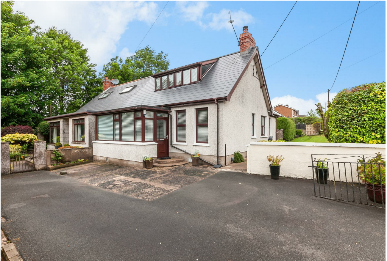
91 Ballyeaston Road, Ballyclare, BT39 9SG