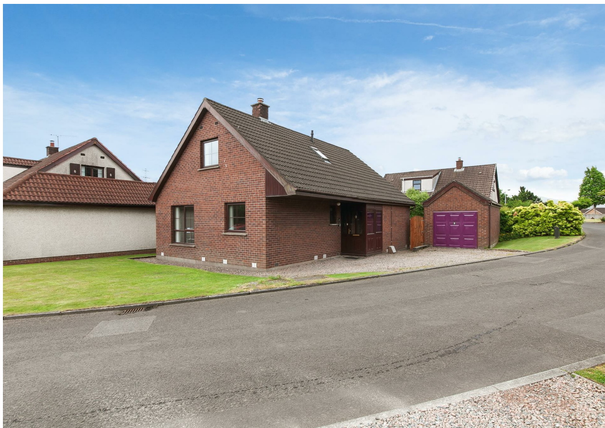
15 Oakfern, Newtownabbey, BT36 5FN