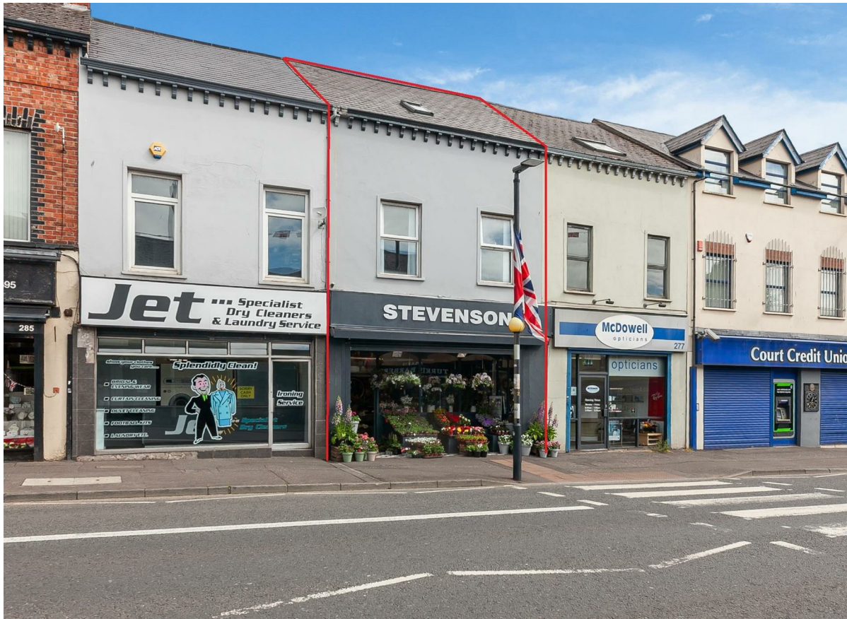
279-281 Shankill Road, Belfast, BT13 1FT