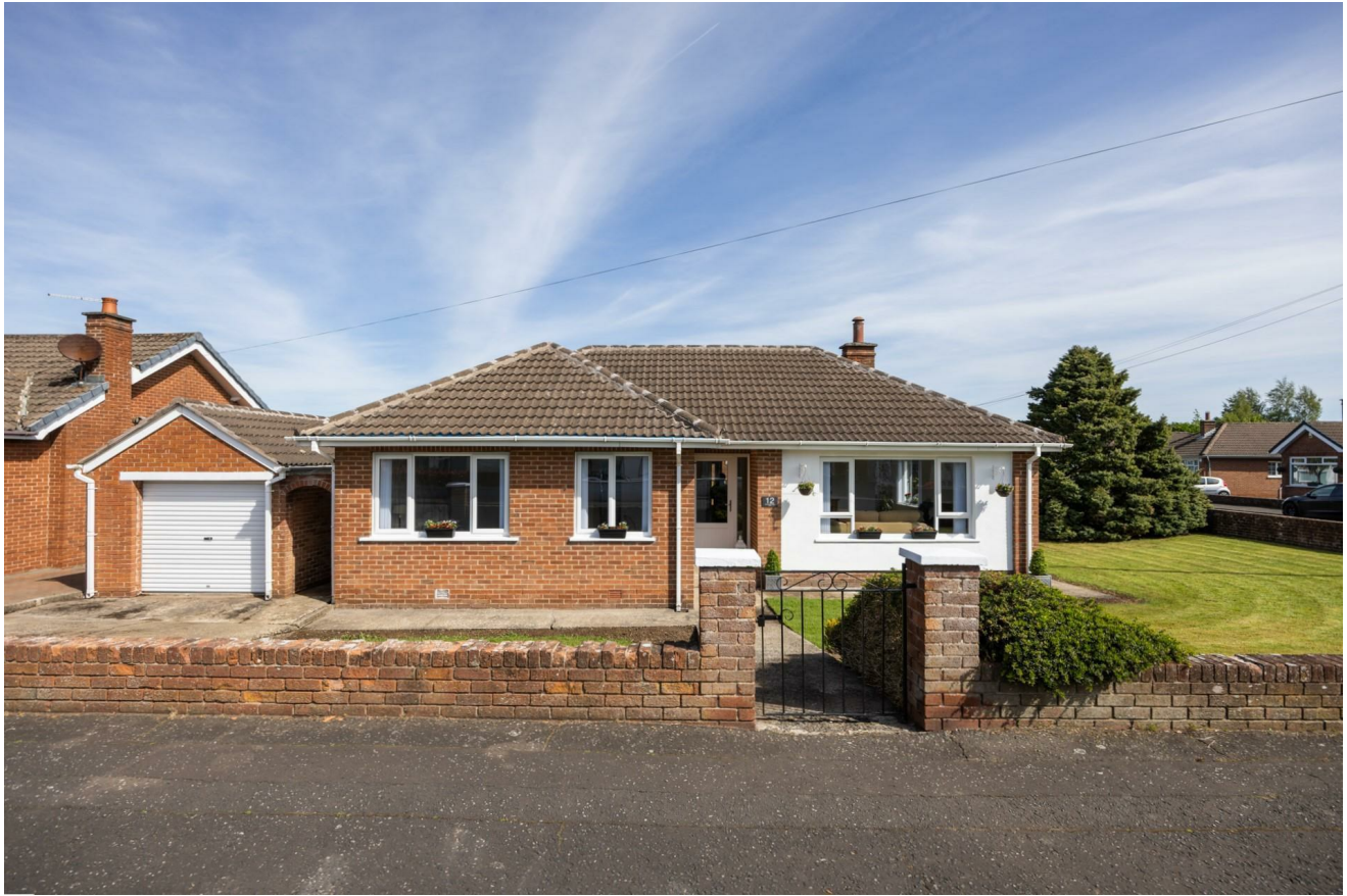
12 Woodford Park East, Newtownabbey, BT36 6TP