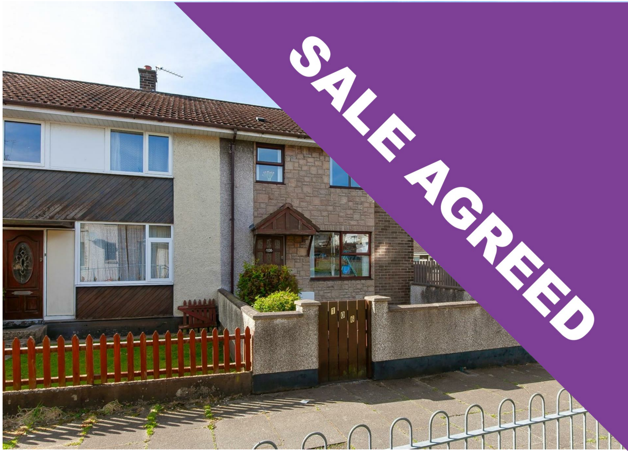
106 Salia Avenue, Carrickfergus, BT38 8NE