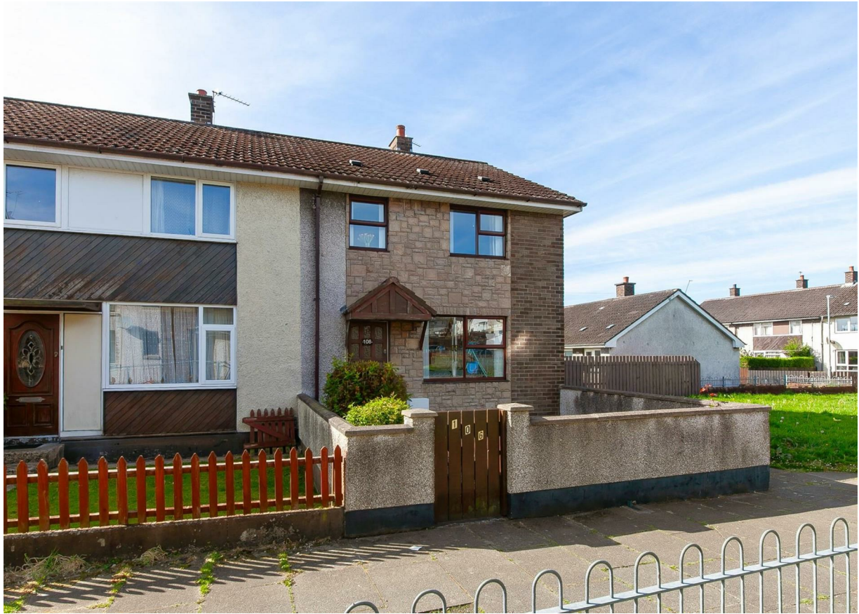
106 Salia Avenue, Carrickfergus, BT38 8NE