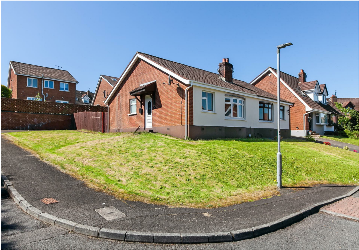
25 Hollybrook Grove, Newtownabbey, BT36 4ZR