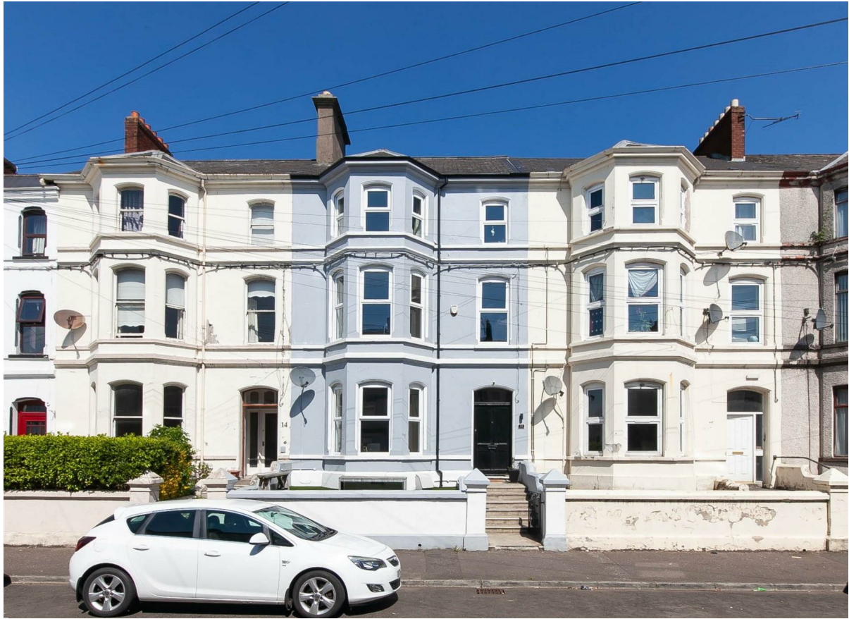
16 Curran Road, Larne, BT40 1BU