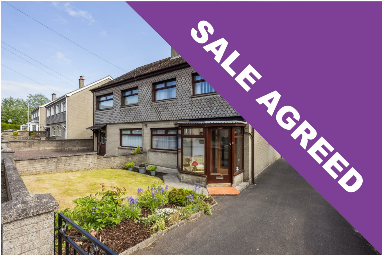
132 Erskine Park, Ballyclare, BT39 9DB