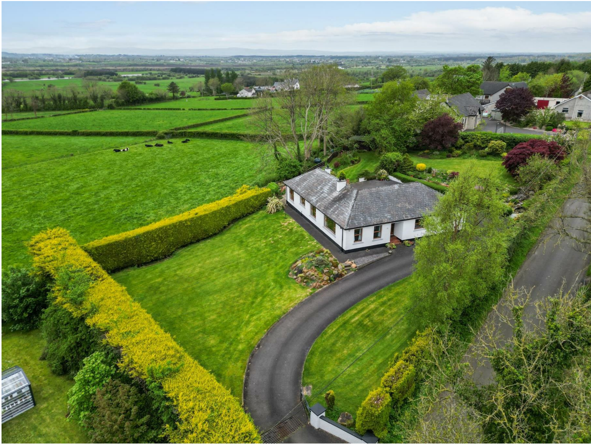
24a Kilcurry Road, Portglenone, BT44 8DB