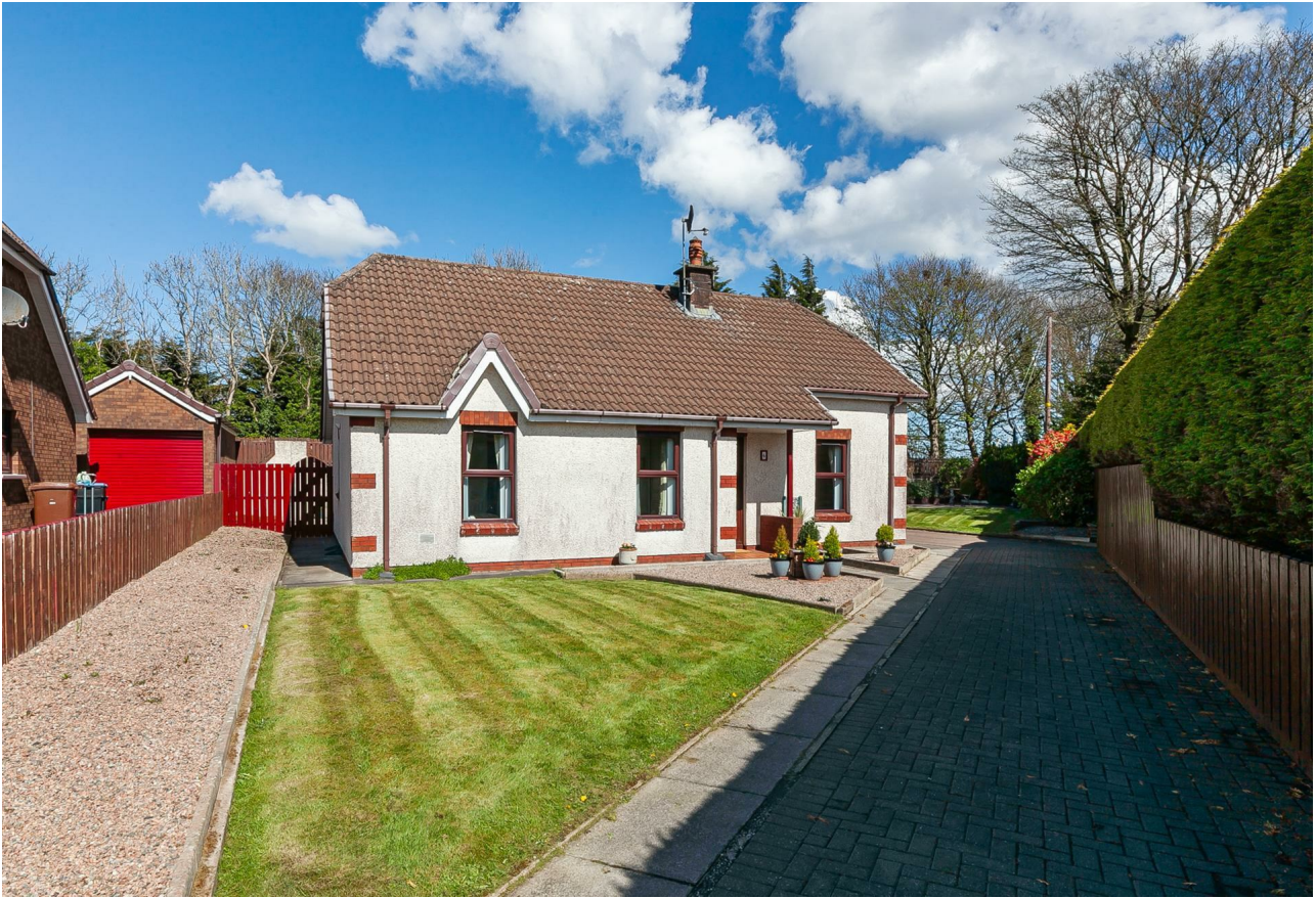
6 Highgate Close, Newtownabbey, BT36 4WE