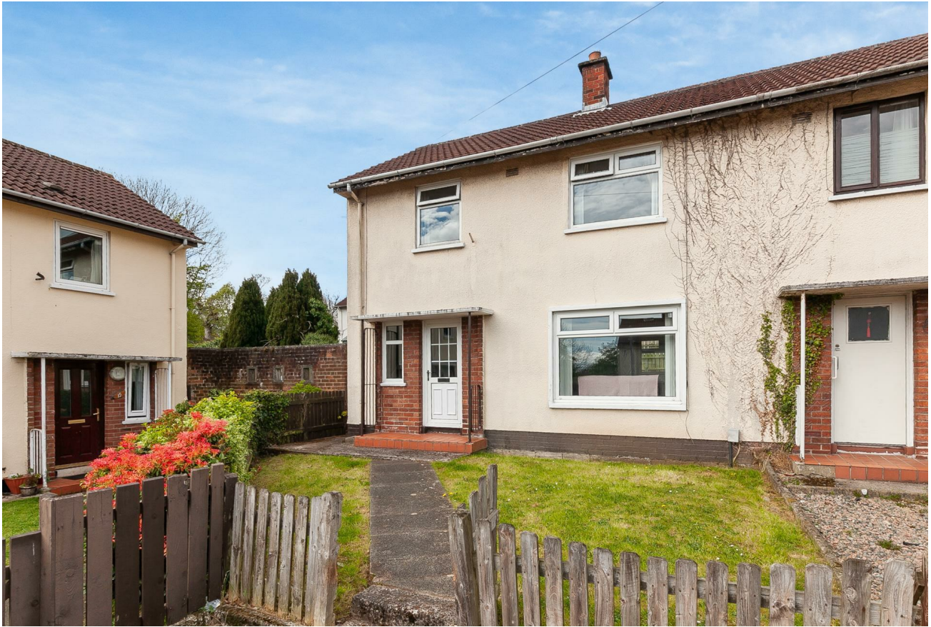
13 Waveney Grove, Belfast, BT15 4FW