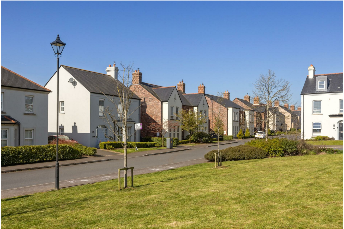
6 Hartley Hall Green, Greenisland, BT38 8FU