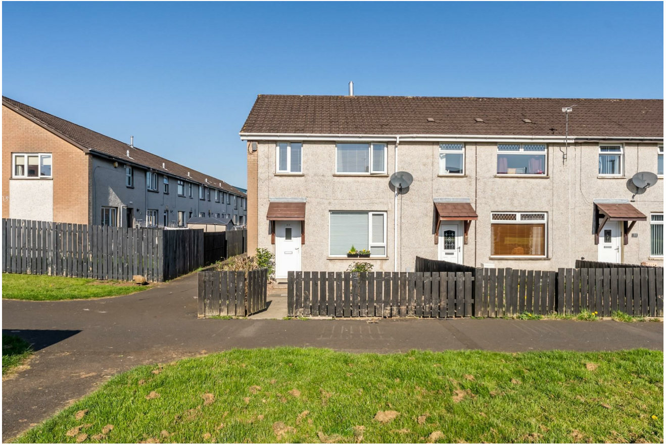
40 Portlee Walk, Antrim, BT41 1EN