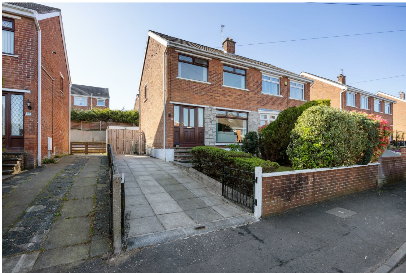
86 Ferndale Road, Newtownabbey, BT36 5AS