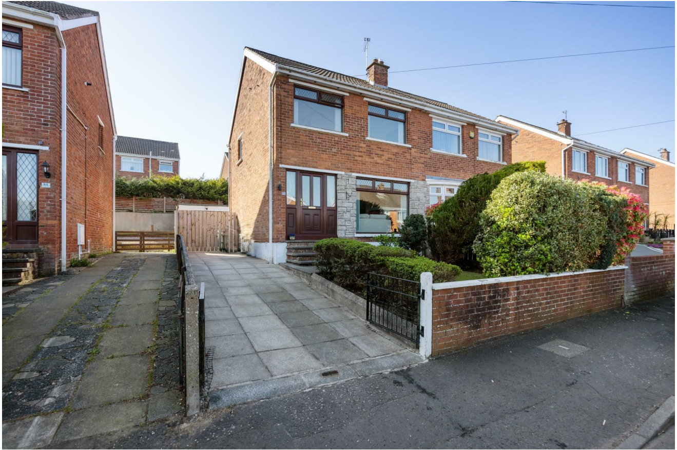
86 Ferndale Road, Newtownabbey, BT36 5AS