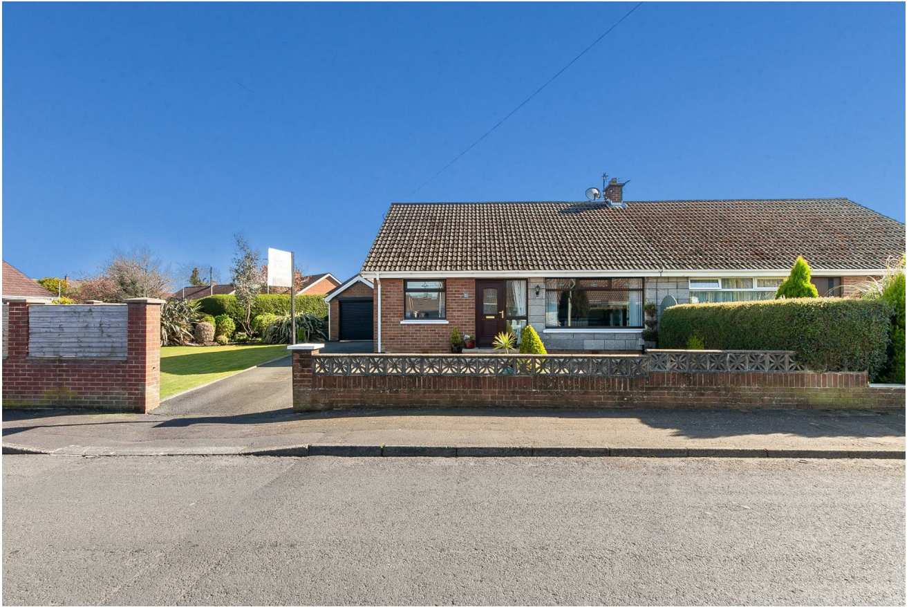
7 Cherryvale Park, Newtownabbey, BT36 7UQ