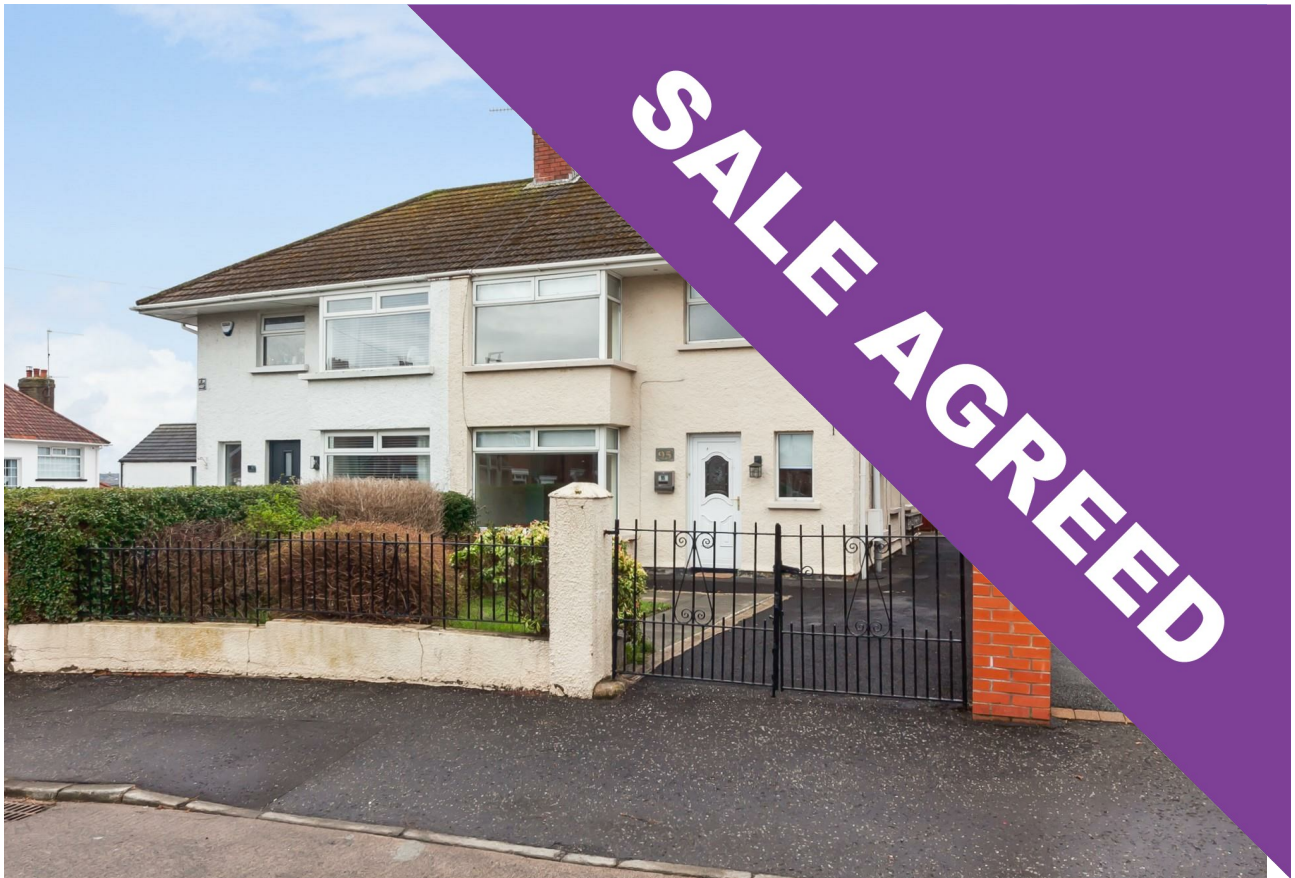
95 Dunlambert Drive, Belfast, BT15 3NF