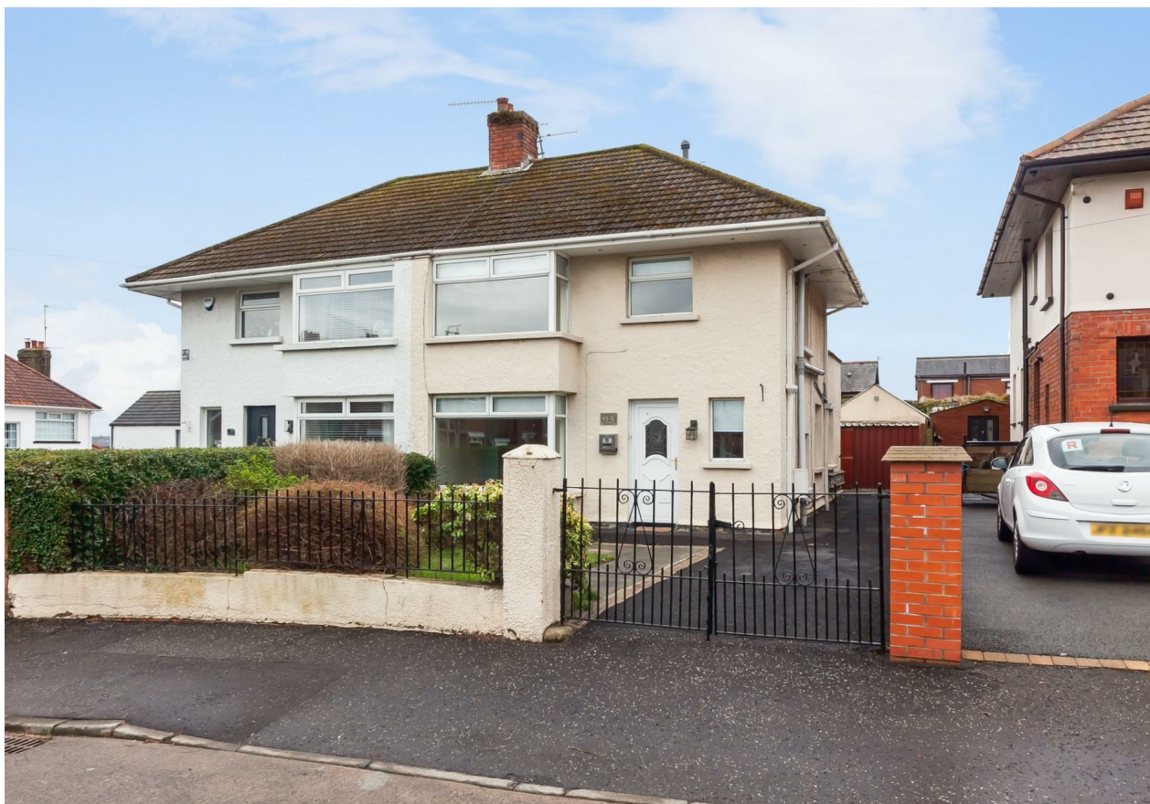
95 Dunlambert Drive, Belfast, BT15 3NF