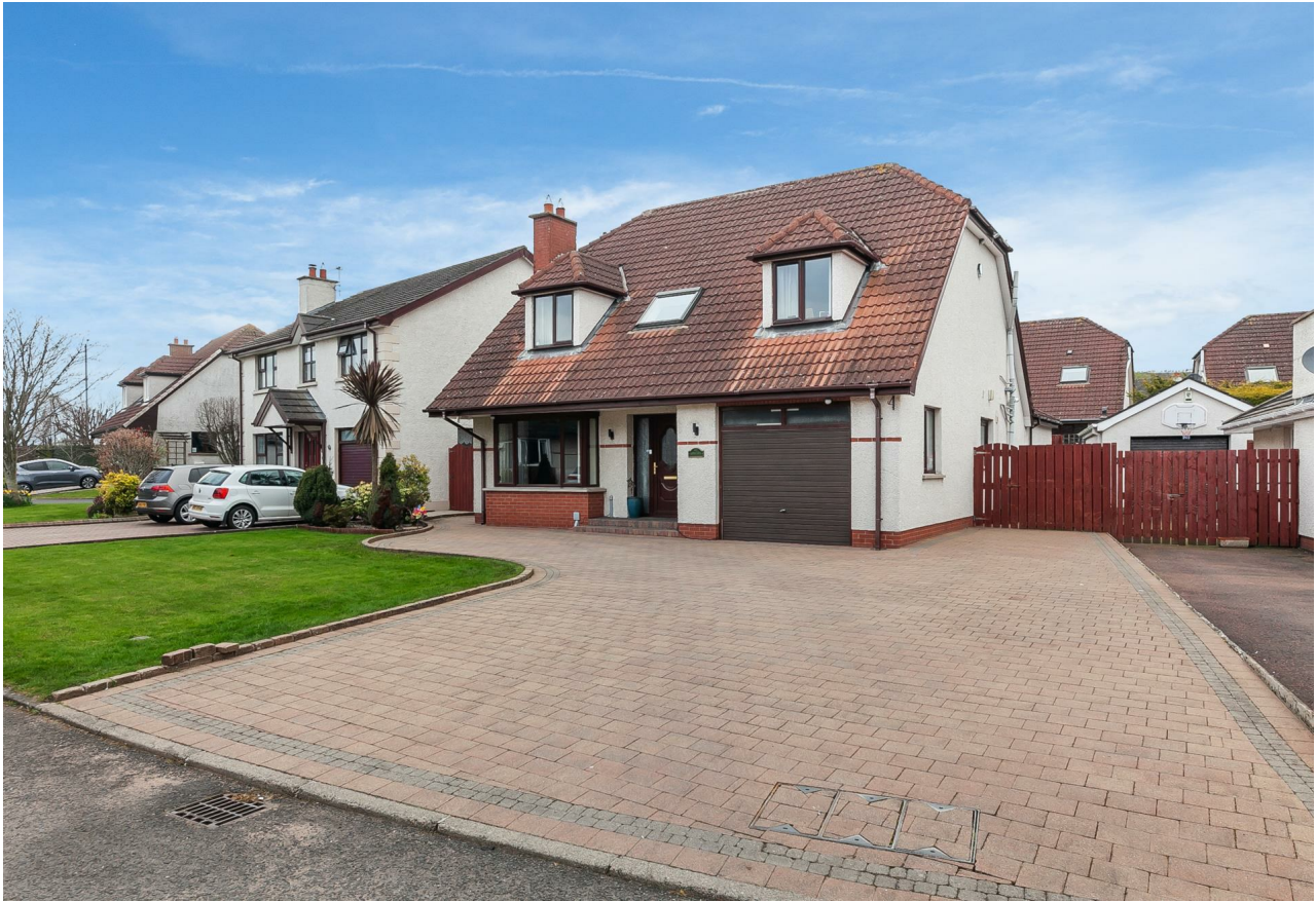
42 Brackenridge Green, Carrickfergus, BT38 8FP