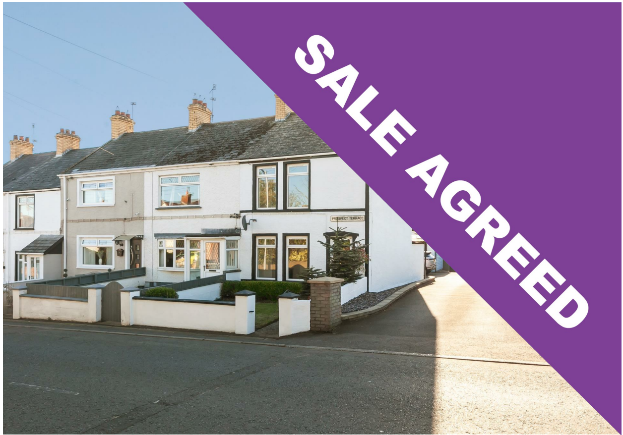
7 Prospect Terrace,, Carrickfergus, BT38 8QE