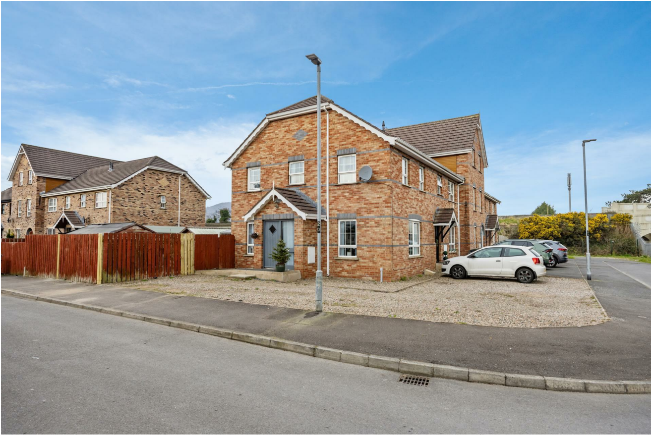
100 Glenview Park, Newtownabbey, BT37 0TG