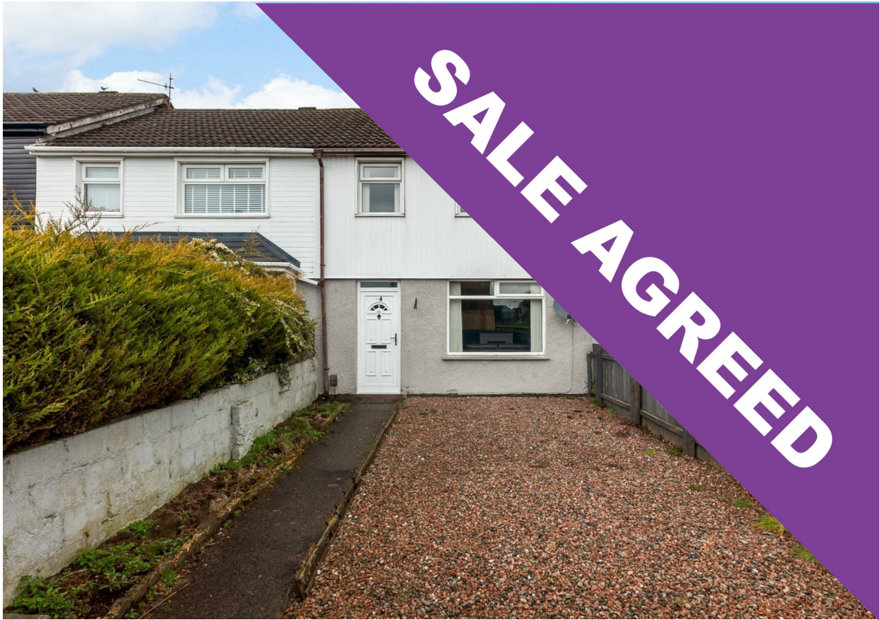
12 Forthill Grove, Newtownabbey, BT36 6QW