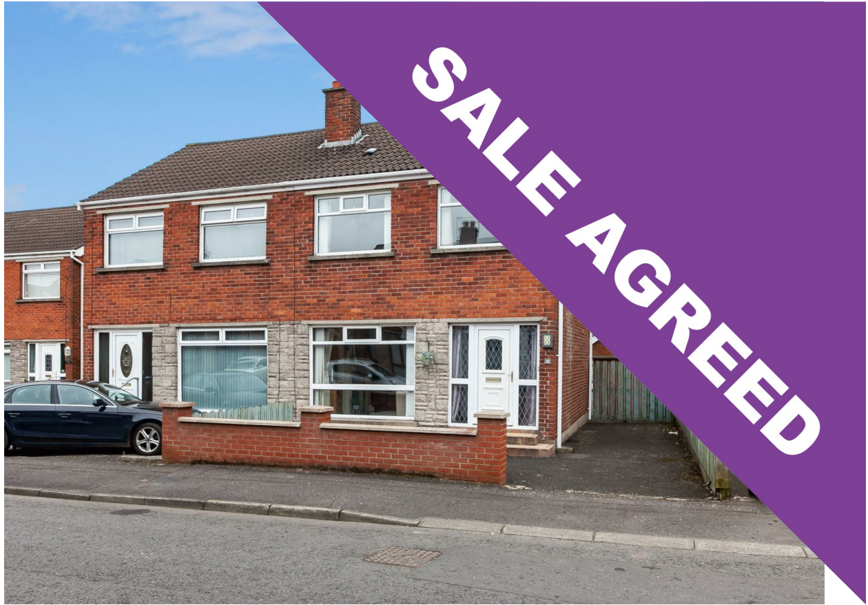
12 Sandyknowes Crescent, Newtownabbey, BT36 5DJ