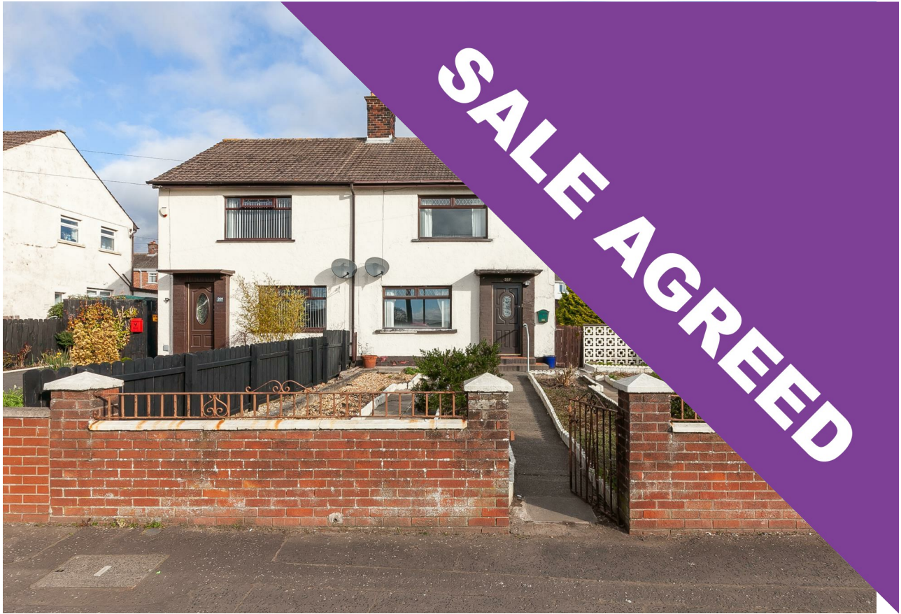
207 Jordanstown Road, Newtownabbey, BT37 0LX