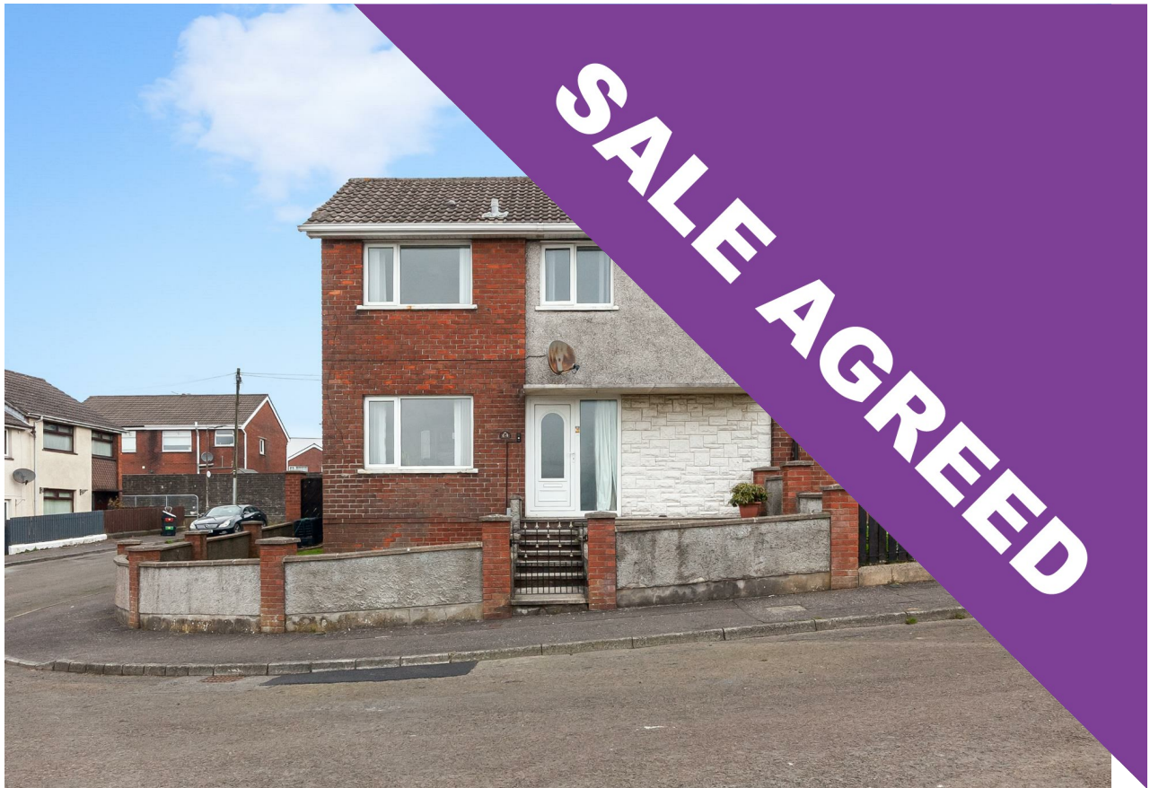
64 Queens Avenue, Newtownabbey, BT36 5HX