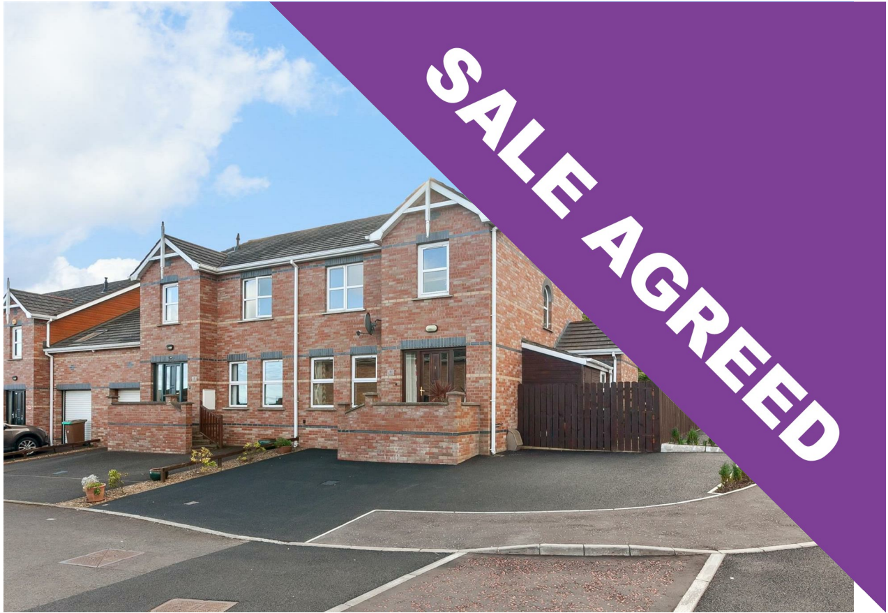
1 Aspen View, Newtownabbey, BT36 6FB