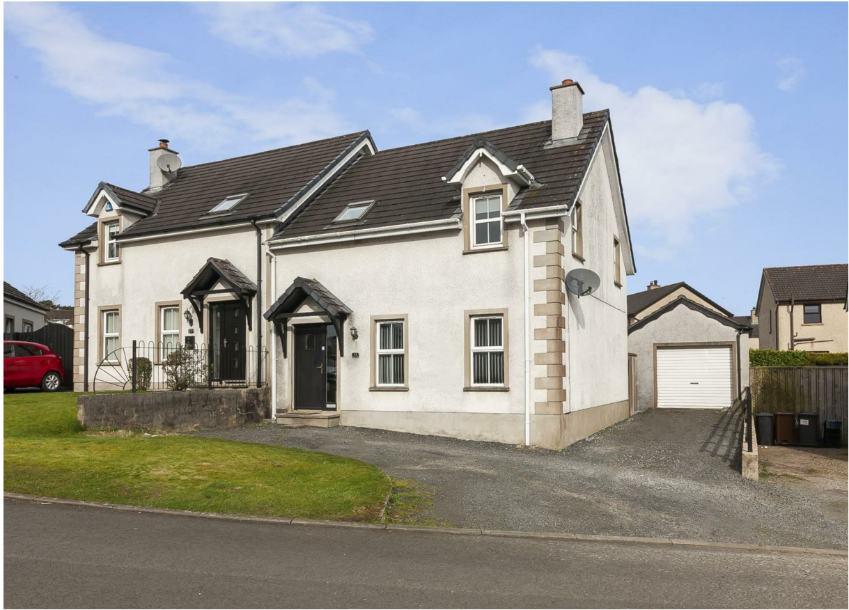
15 Douglas Avenue, Doagh, Ballyclare, BT39 0UA