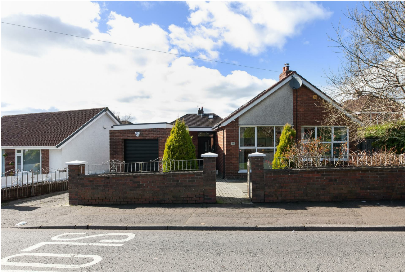
51 Glebe Road West, Newtownabbey, BT36 6EH