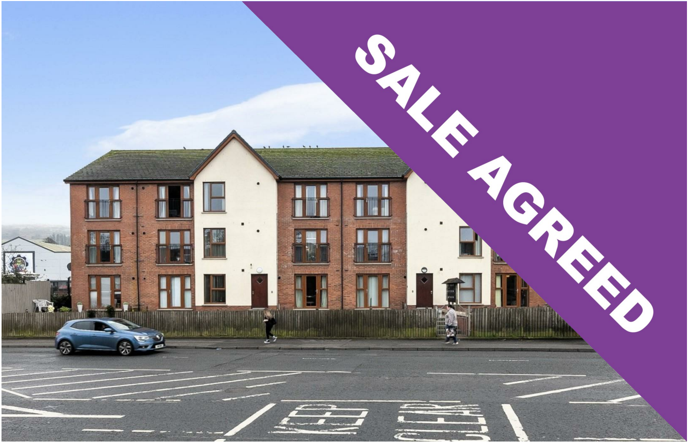
Apartment 15, 288 Antrim Road, Newtownabbey, BT36 7QT