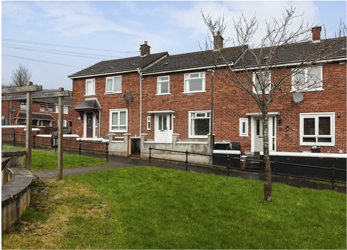
22 Mount Vernon Drive, Belfast, BT15 4BP