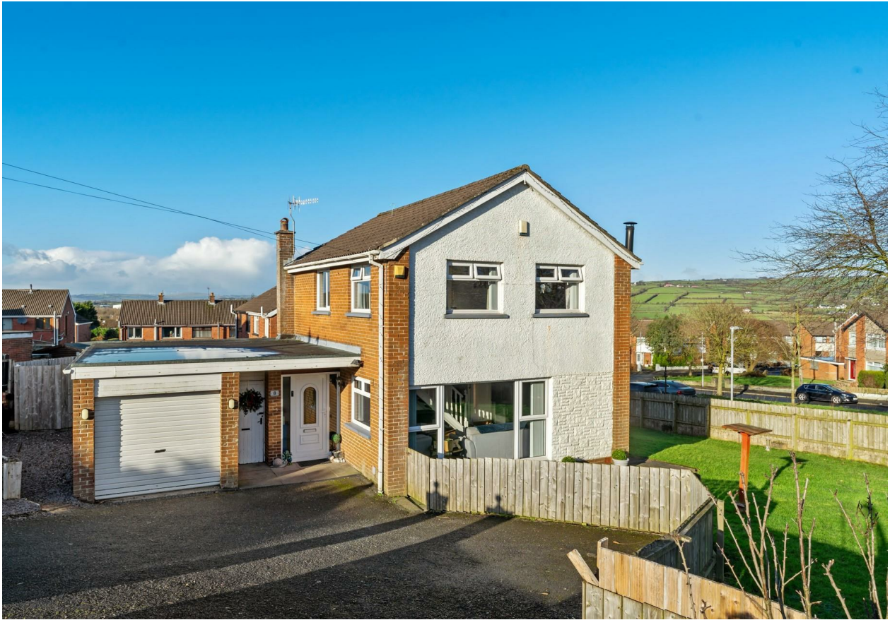
8 Kimberley Drive, Newtownabbey, BT36 6NB