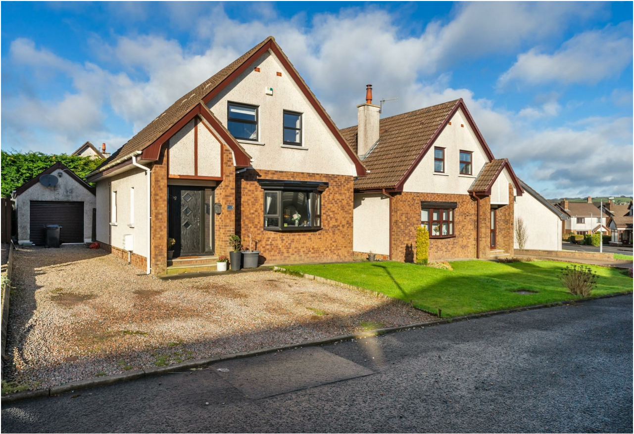
31 Craiglunds Manor, Newtownabbey, BT36 5FG